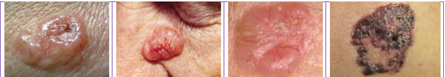
Basal cell skin cancers

Dr. Warburg has made it clear that the root cause of cancer is oxygen deficiency, which creates an acidic state in the human body. Dr. Warburg also discovered that cancer cells are anaerobic (do not breathe oxygen) and cannot survive in the presence of high levels of oxygen, as found in an alkaline state.