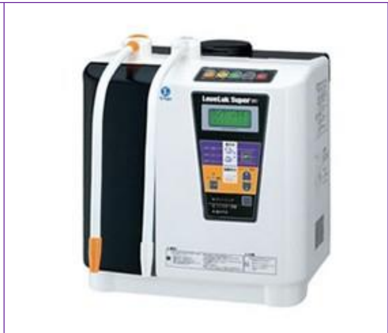
Leveluk Super SD 501