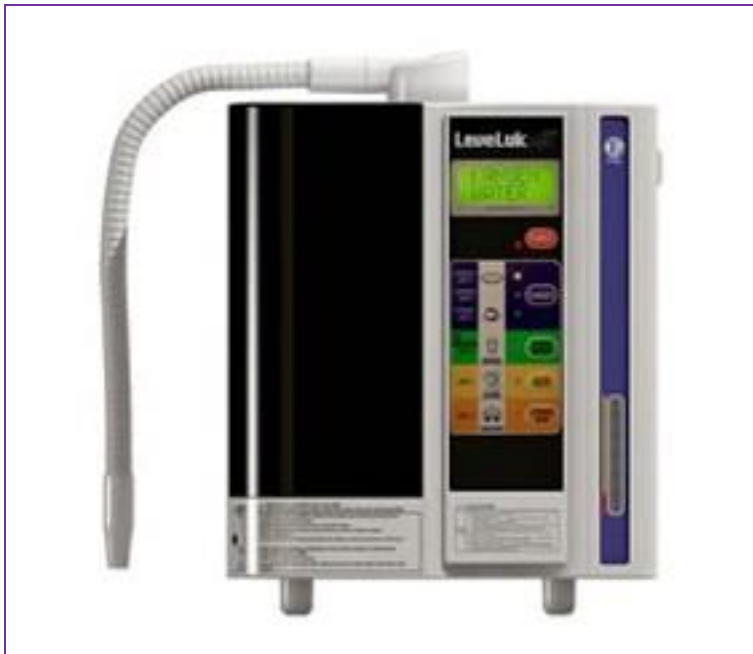
Leveluk SD 501

Green is neutral. Light to dark purple is alkaline. Yellow to red is acidic.