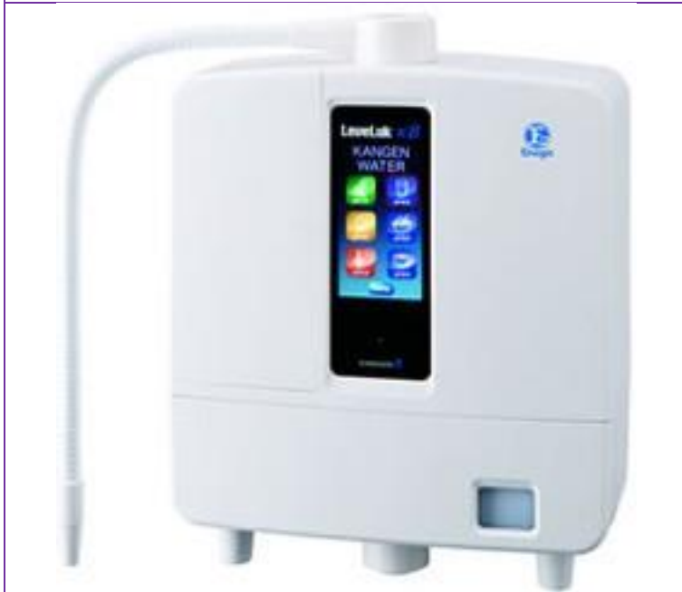
Leveluk Kangen 8